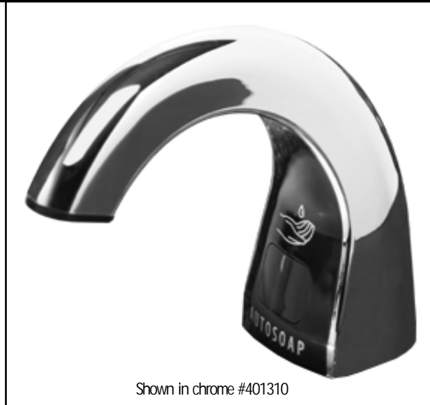
Shown in chrome #401310